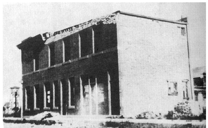
The First National Bank after the 1925 earthquake.

The earthquake of 1925, centered near Lombard, crumbled the decorative stonework around the eaves of the building, marring the bank’s image. Labor National Bank did not survive the Stock Market Crash of 1929 and the Masons negotiated with the receivership to purchase the building. Their first meeting in their new lodge was held March 15, 1933. Previous to moving into their new lodge, the Masons used the second floor of the